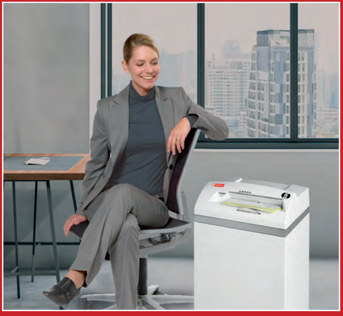
Commercial and NSA Listed Office Paper Shredders - Page 6