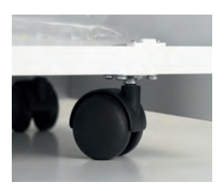
Mounted on casters for easy relocation anywhere in a facility