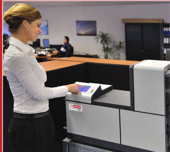
Mail Folders/Inserters - Page 10