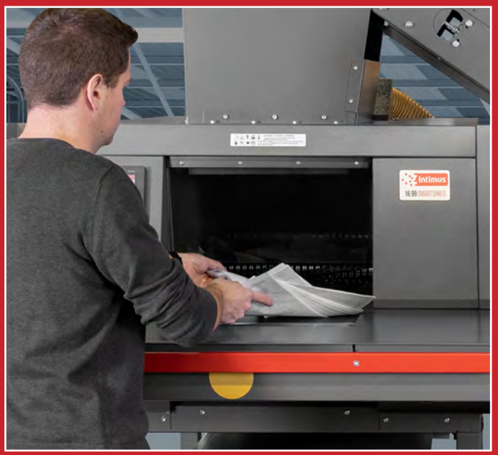
High Volume Industrial Shredders/Shredder Baler Combos - Page 8