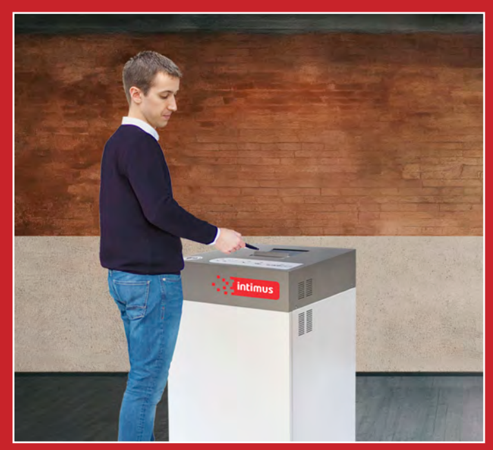
Multimedia Shredders and Sanitization Equipment - Page 4