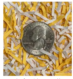
Example of particles created by intimus CP5 shredder models