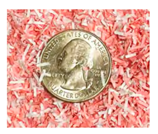
Actual 0.8 x 4.5 mm particles. 25% smaller than NSA requirements.