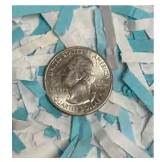
Example of particles created by intimus CP4 and CC3 shredder

With waste particles that measure around 1/8^{\prime\prime} x 1^{\prime\prime}_{4}^{\prime\prime} they render documents unreadable and satisfy most commercial destruction requirements including HIPAA.